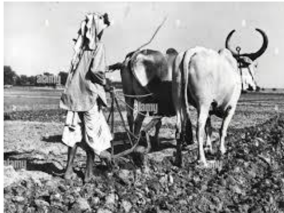
Figure 1: Traditional Agrarian Farming System in North Odisha during the British Colonial Period

The emergence of the British colonial administration in Odisha in the 19th Century witnessed several changes in the economy and the agrarian system of the region. The introduction of new revenue systems by the colonial administration had the main goal of maximizing income and controlling agricultural resources of the region. Land reforms like the Permanent Settlement helped strengthen the position of zamindars by giving them proprietorship of land, while the peasants were made tenants without any security for their lands. Besides the changes caused in the economic structure of the rural community due to economic policies of the colonial regime that helped commercialize agriculture, the farmers had to focus on producing crops for exports rather than producing crops for subsistence.