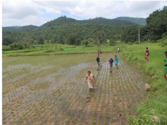
Figure 2: Traditional Rice Cultivation Practices in Rural North Odisha during the Agrarian Season

communities in many parts of Odisha, especially in the forest and hilly terrain, practised shifting cultivation and had great dependence on forests as a source of food, medicines, fuel, and other necessities of life. They led a self-reliant existence in tune with nature. There is an inseparable link between traditional agricultural practice and tribal wisdom in Odisha.